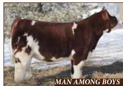
MAN AMONG BOYS