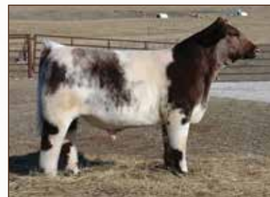
CF PRIMO X ET