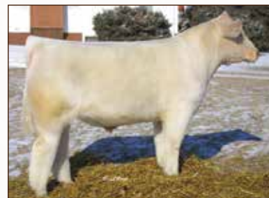
AF SL SIN CITY ET