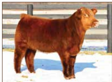
TRNR ADVANCE 284 ET