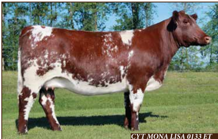
CYT MONA LISA 0133 ET