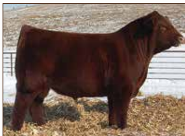
SULL RED DEMAND 9329 ET