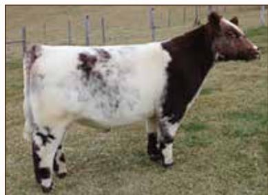
CANNONDALE SCOTCH 149