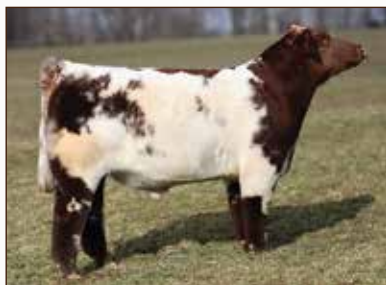
SULL GNCC ASSET