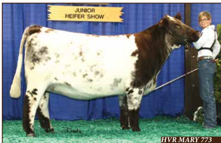
HVR MARY 773