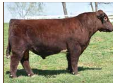
RSF RED ALERT 0123A