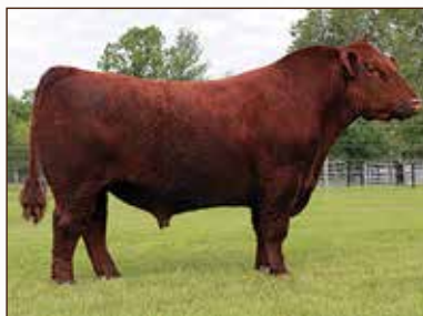
NBS LOW RIDER 42W ET