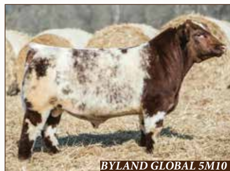
BYLAND GLOBAL 5M10