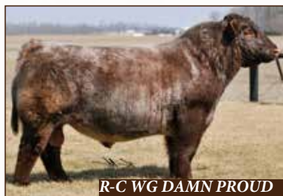
R-C WG DAMN PROUD