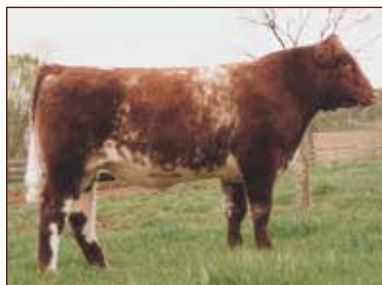
TCC COUNTRY MUSIC SINGER