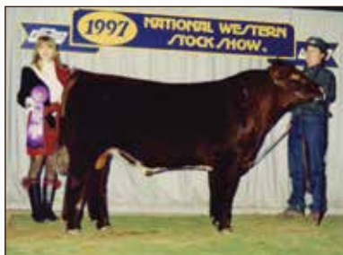
GFS CREOLE 9590 ET