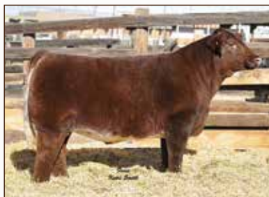
JSF MCCOY 39Z