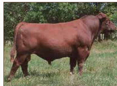
BYLAND MISSION 6RD122